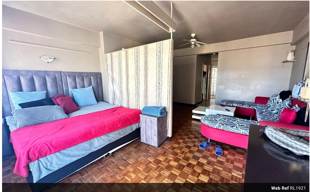
Web Ref RL1921