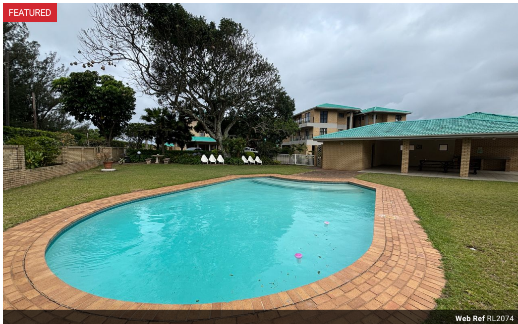
Web Ref RL2074