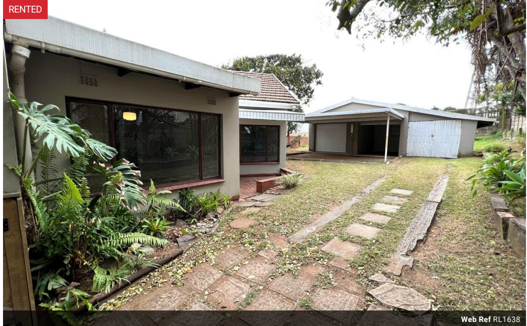
Web Ref RL1638